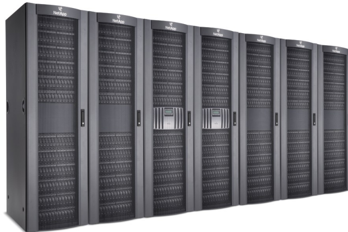
Figure 1) FAS6080 system.

Another Data ONTAP 7G feature, FlexClone®, instantaneously creates cloned LUNs or volumes without requiring additional storage. FlexClone can dramatically improve the effectiveness and productivity of application and database development and predeployment testing.