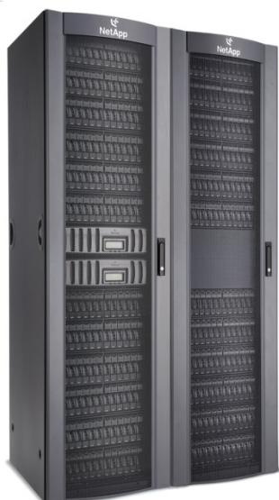
Figure 3) FAS3040 system.

The FAS2000 series provides departmental and remote office storage for distributed enterprise deployment and is an ideal system for primary storage in midsize enterprises. FAS2000 systems offer integrated block- and file-level data access, intelligent management software, and data protection capabilities like higher-end FAS systems in a cost-effective package. Innovations include internal SAS (Serial-Attached SCSI) or SATA disk drive support, external FC or SATA expansion, more connectivity choices, and onboard remote management.